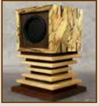
Art Deco Pedestal