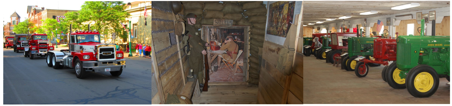
4386 U.S. Route 11, North Homer Ave, Cortland, NY 13045