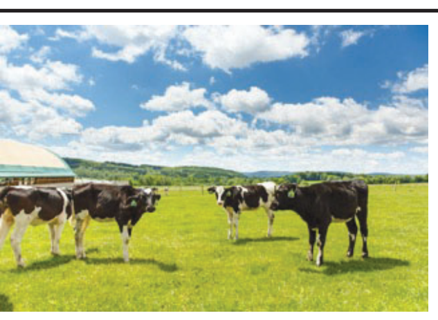
04 THE CORTLAND AREA TRIBUNE March 29 – April 11, 2017