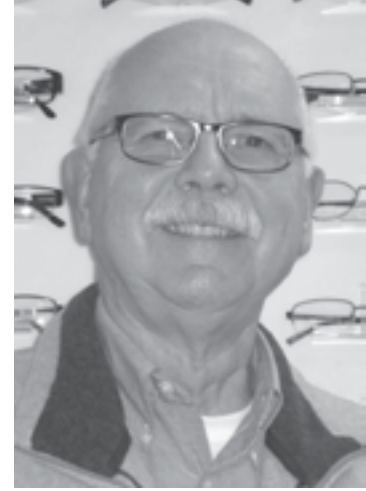
Last Issue's Business Owner Photo Contest