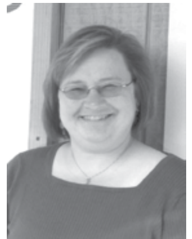
Last Issue's Business Owner Photo Contest