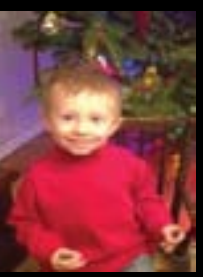
"The BEST treats to be left under the tree this year are those from the East Side Bakery, and believe me, I know!"

HOLIDAY SPECIALTIES AVAILABLE ALSO MONTH OPEN CHRISTMAS EVE 8am to 2pm